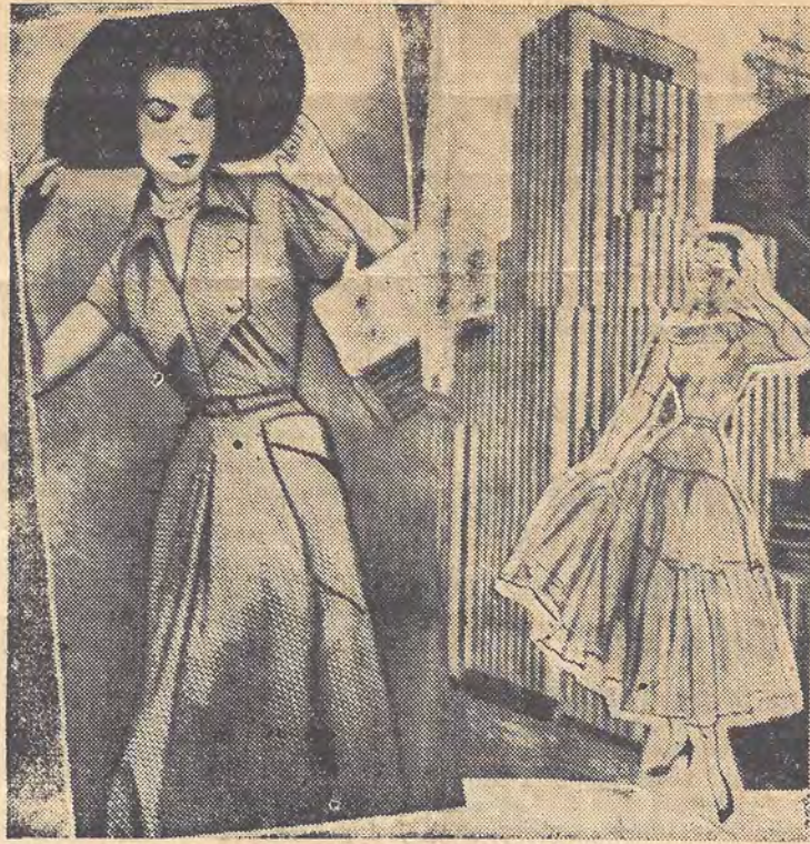
Amerikanerinnene danset nyåret inn i ballerinakort tyllskjørt. Over delen varierte fra dristigste strapless til langmet tricotgenser. — Julekjolen i New York var i år sommerlig mønstret silke. — Begge modellene er fra Fifth Avenue, henholdsvis Burnett og Russeks.