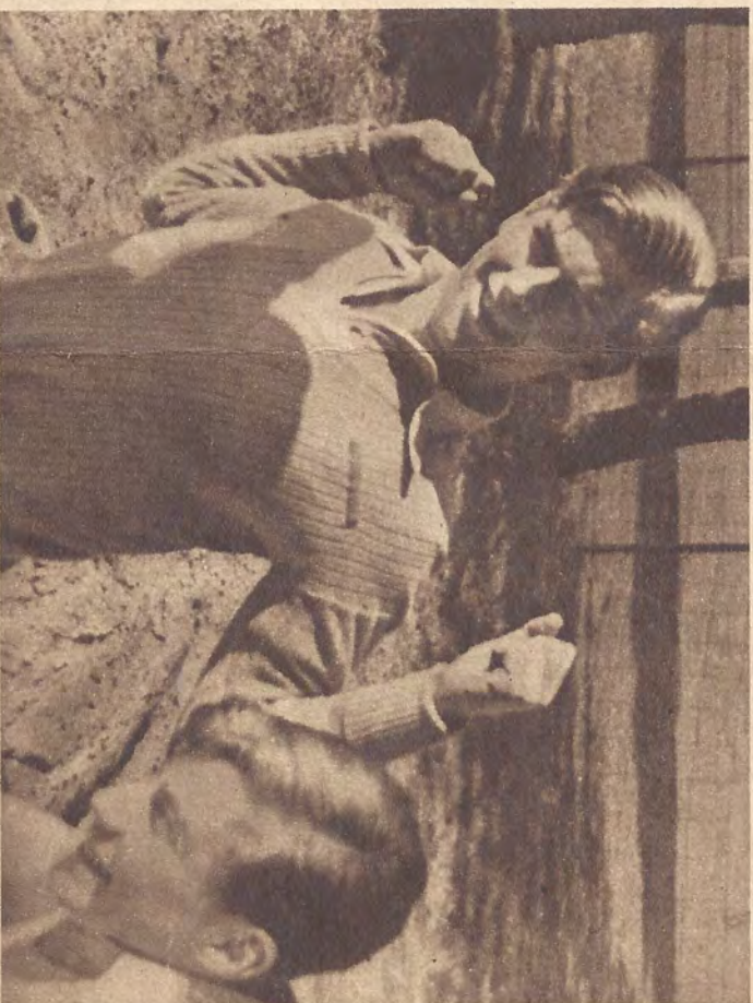
Han var kaptein og centerforward i skolens hockeylag og satte rekord som skolens beste scorer og vant et navn som god idrettsmann.