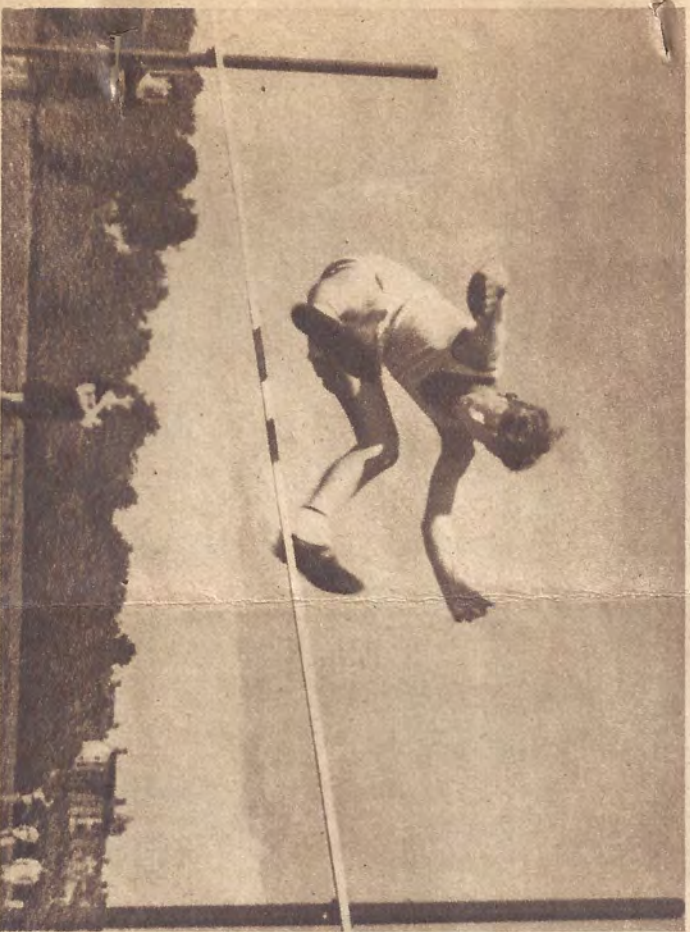
Philip Mountbatten er sportsmann på sin hals. Da han var i Gordonstoun representerte han sin skole ved de skotske friidrettsstevner.